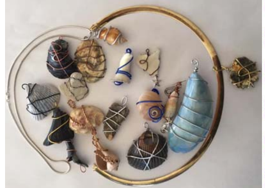
Shell Jewelry in January